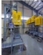
Gas Bottling Unit