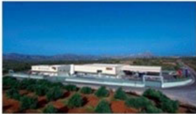
Central facilities – Factory in Chania – Crete- Greece