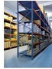
Warehouse in Crete