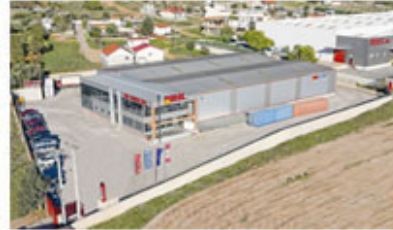
Warehouse in Athens - Greece