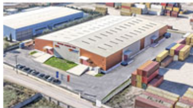
Warehouse in Thessaloniki - Greece