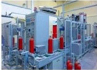
Automatic Production Line