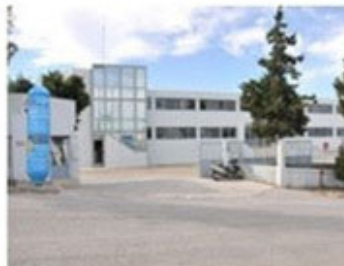
Warehouse in Heraklion - Crete